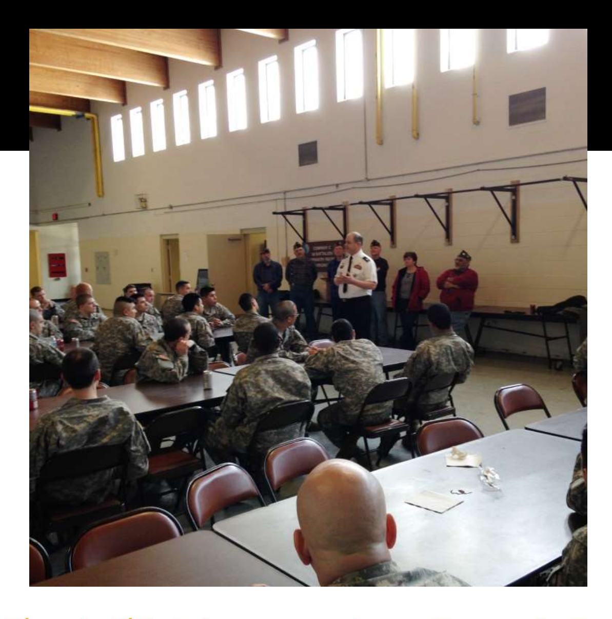
After 2<sup>nd</sup> and 3<sup>rd</sup> helpings were done, Comrade Greely shared a few words of encouragement!