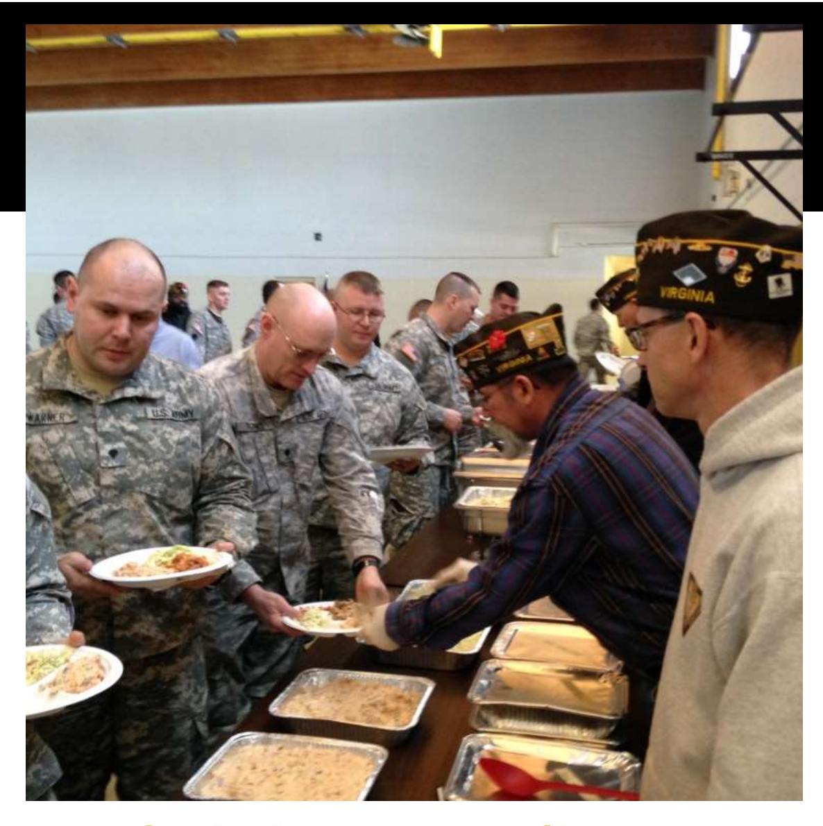
There was plenty to go around!