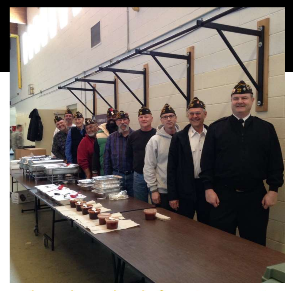
Post members showed up in force to support our home town heros!