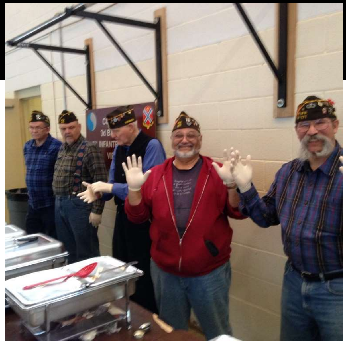
Post members demonstrate that everything is sanitary!