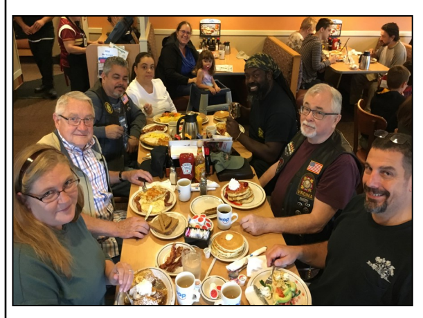
The Post's Rider Club enjoying breakfast at the Leesburg IHOP while hosting their meeting and Veterans Breakfast