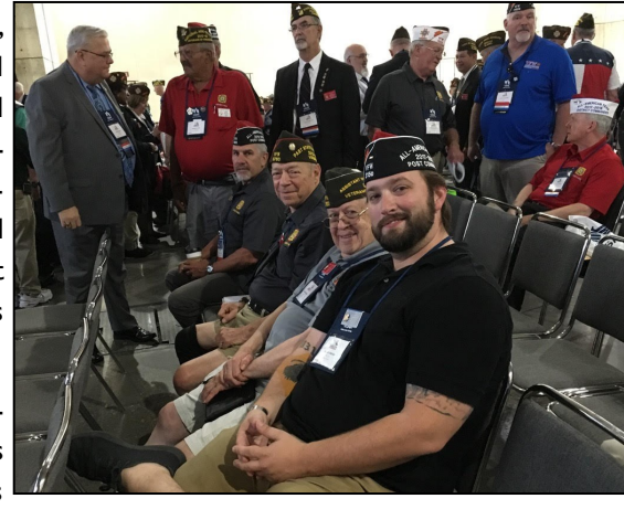
The Virginia Delegates gather before voting on the new by-laws.

The convention also featured representatives from various organizations seeking to support veterans, panels focused on post management, membership growth and supporting