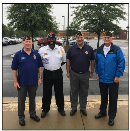
Post 1177 and AL 2001 attend 9/11 ceremony at Ashburn