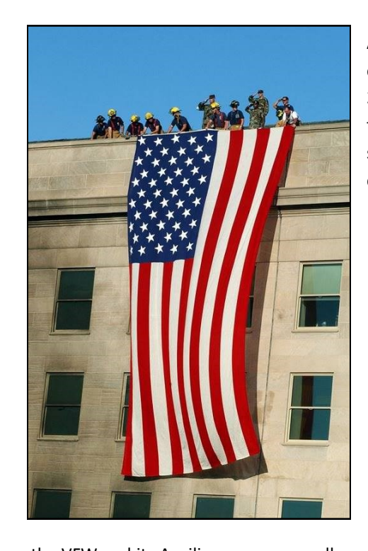
the VFW and its Auxiliary encourage all

Americans to take a moment to reflect on all that has changed since Sept. 11, 2001, and to remember the victims, their families, and those who've selflessly sacrificed to ensure our way of life remains. **